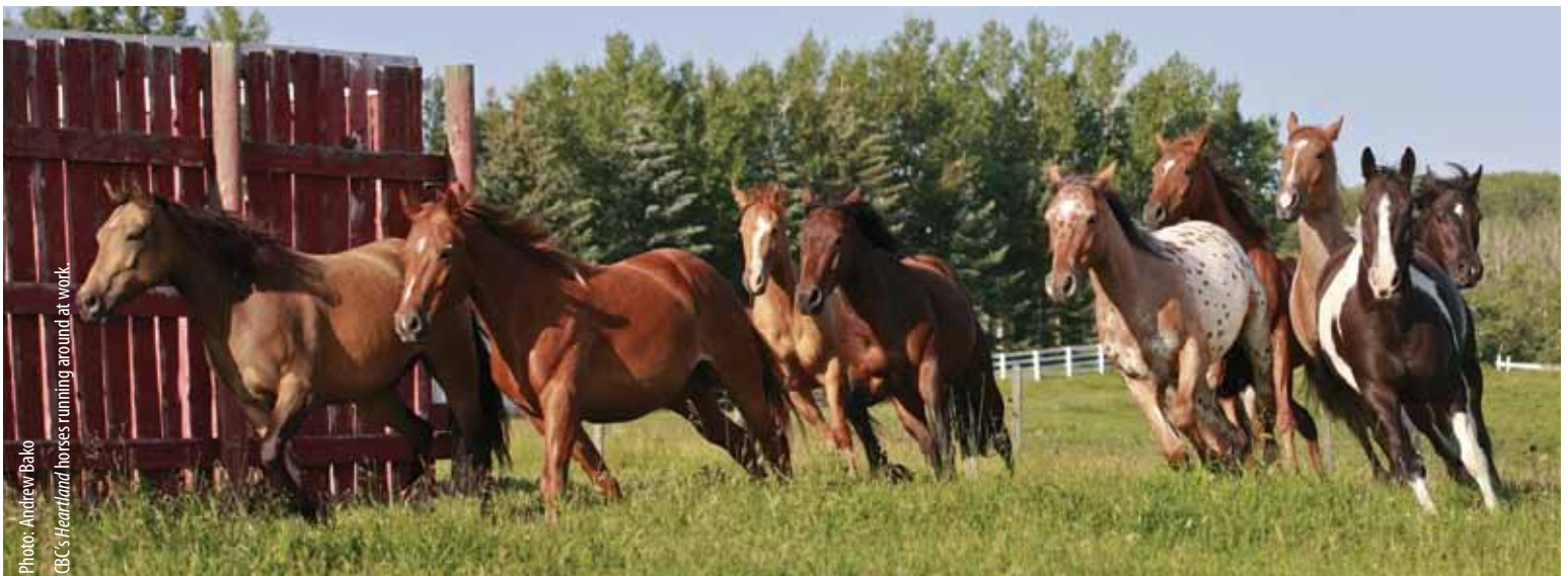
CBC's Heartland horses running around at work.