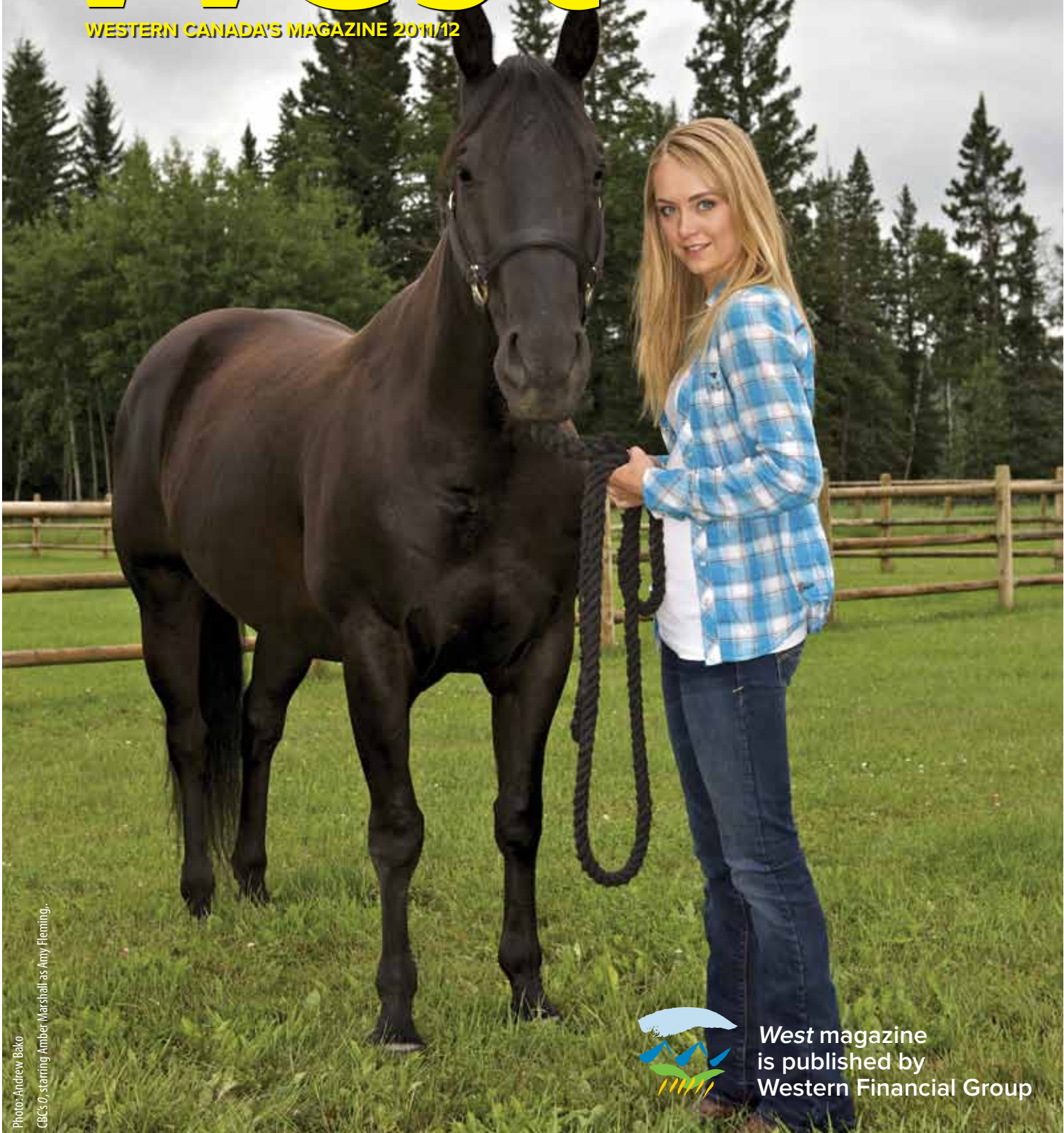
CBC's O, starring Amber Marshall as Amy Fleming.